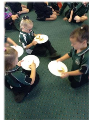
Harmony Day celebrations Food from around the world