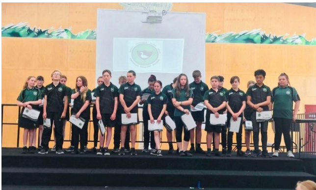
Our 2020 Grade 6's