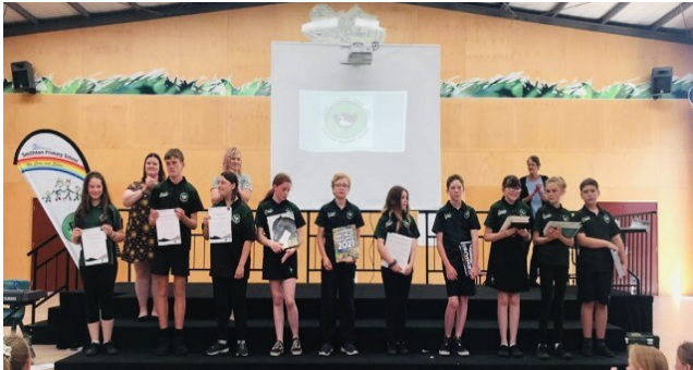
Grade 6 Award Recipients