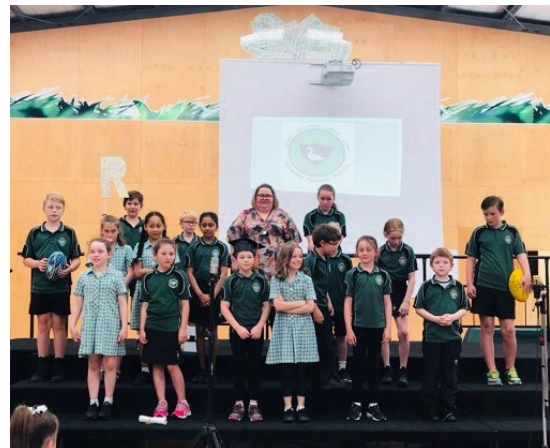
3/4 Gausden sharing the song they had written