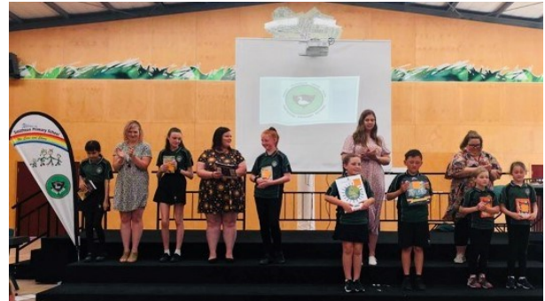
Upper Primary Class Award Recipients