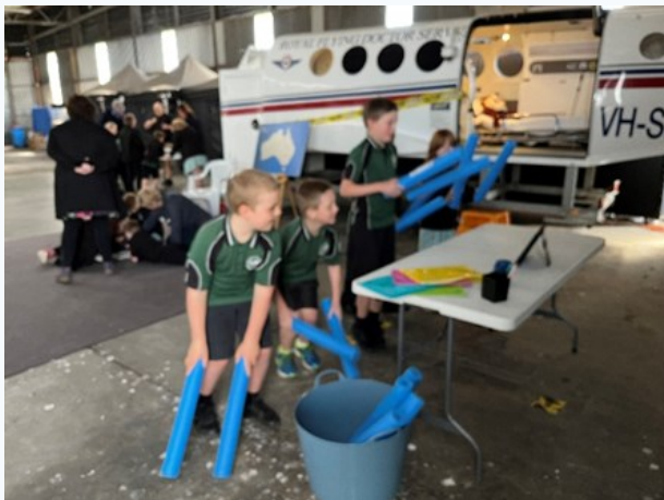
Using our bodies to stay healthy.