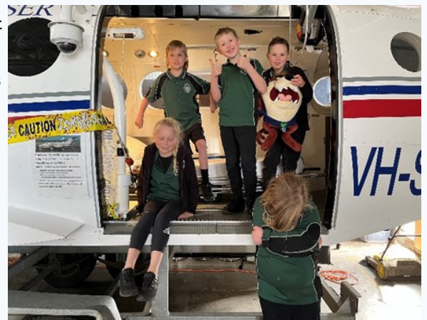
New RFDS flight crew.