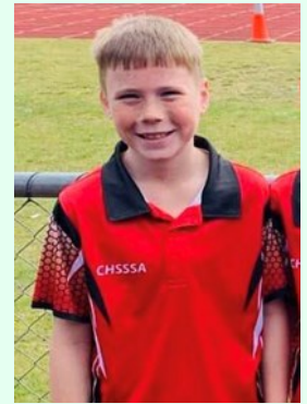
100m and Relay