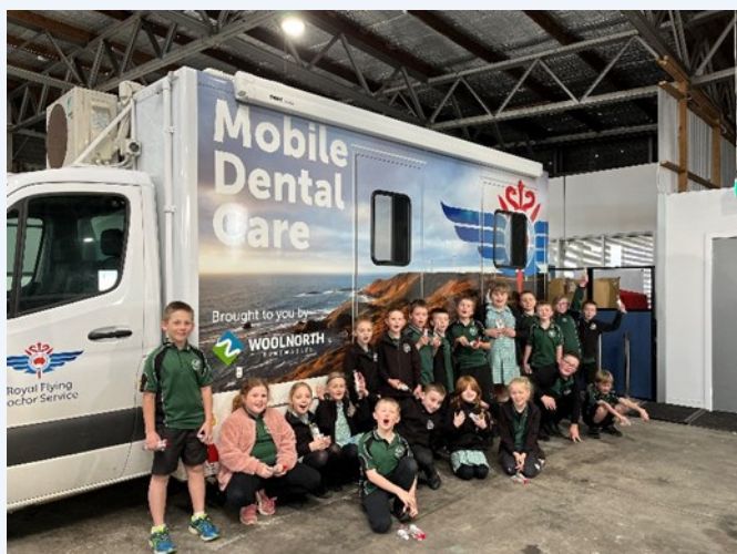
This mobile dental care van was purchased for the RFDS by owners of Woolnorth