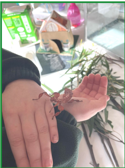
Stick insects in I-2 Goodwin