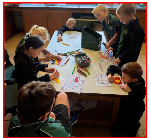
I-2 Irvine preparing for NAIDOC week