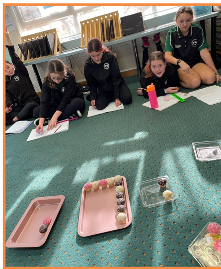
5-6 Maths with cupcakes!